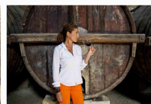
Valle dell'Acate Acate, Sicily, Italy 意大利